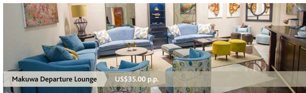
Makuwa Departure Lounge US$35.00 p.p.